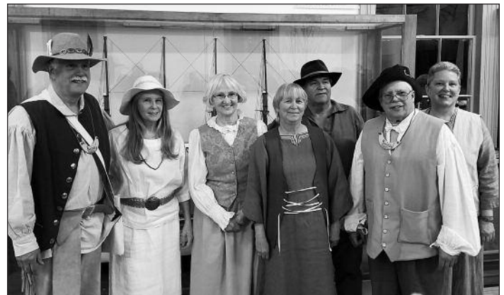
The Old Home Week Committee wore period garb to the Orrington Historical Society's open house celebrating Orrington's 230th birthday.

Operation Christmas Child will hold its New England conference in Orrington during the opening weekend and will launch their drive