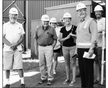
Take an informative tour of the PERC plant

Ever wonder what happens to your household waste after you put your garbage bags or trash cans out for pick up? Find out on Saturday, July 22, when the Penobscot Energy Recovery Company - PERC - holds its second annual Open House from 10:00 a.m. to 2:00 p.m. as part of Old Home Week. There will be educational displays and a special "touch-a-truck" display featuring heavy equipment, trucks, and police, fire, and rescue vehicles. There also will be games for the kids and a live remote broadcast from Q-106.5, Maine's #1 for New Country. Plus, take a tour of the facility where you can see The Terminator - PERC's new Komptech 6000s slow-speed grinder - and be entered to win some great prizes. (You